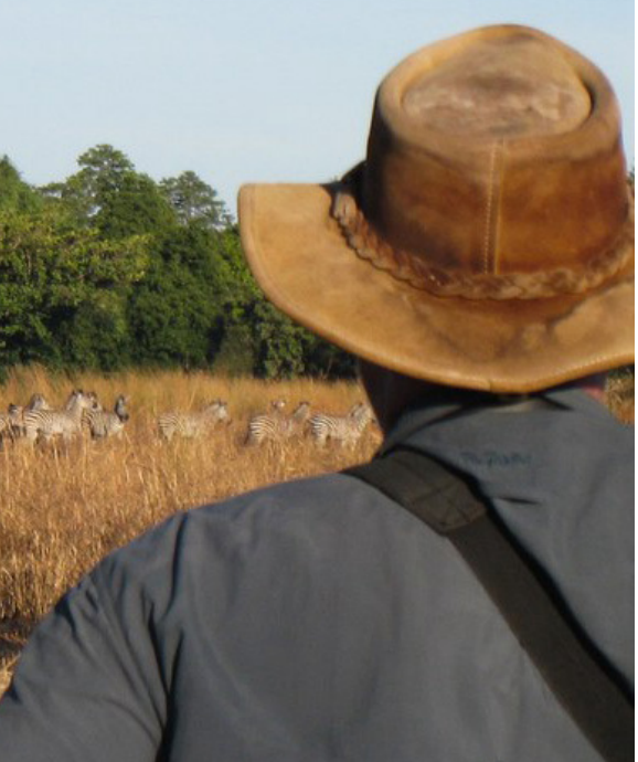
Picture left side: hiking through man-high grass in Malawi; right side: "Zebra-crossing" in Zambia