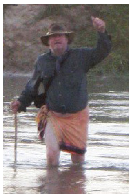
Picture left side: hiking on asphalt roads in Malawi; right side: no bridge to cross the river