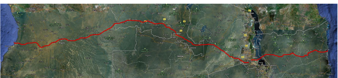
Figure: Overview of the route map